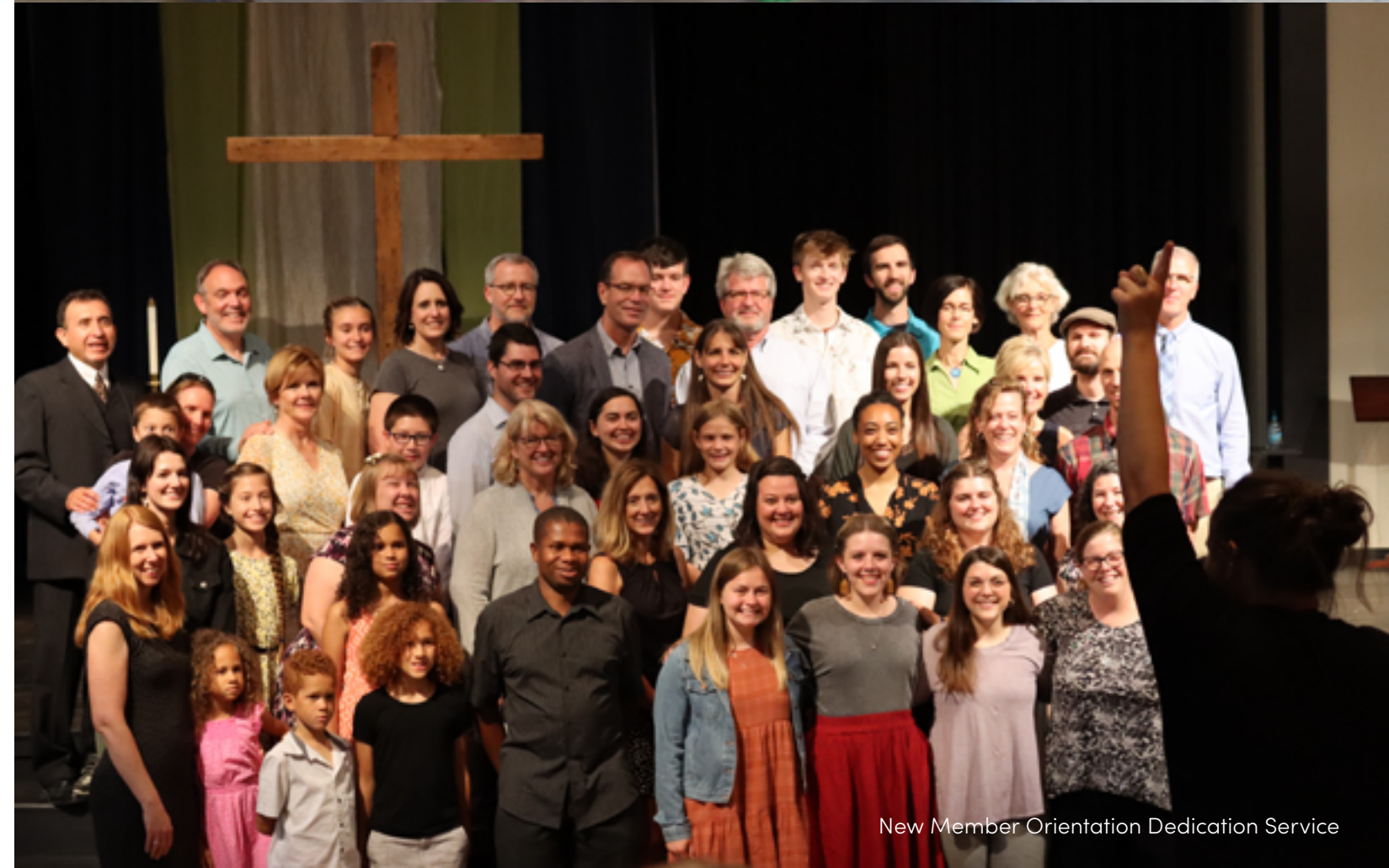
New Member Orientation Dedication Service