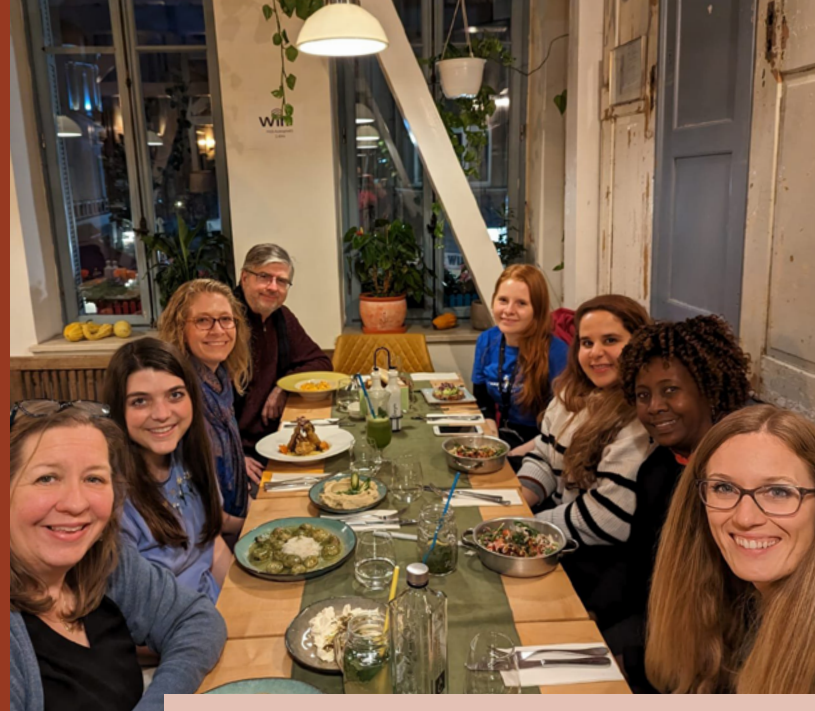
Top: Bucharest Christian Academy Team Dinner Bottom: End of Year picnic at Black Forest Academy