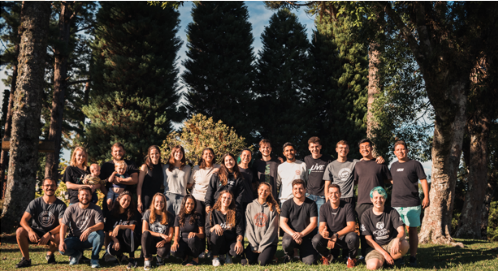
Theological Seminary Students Uruguay