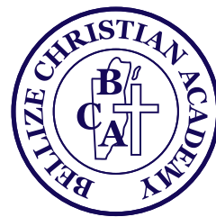
BELIZE CHRISTIAN ACADEMY belizechristianacademy.com

Started in 1958 in Paraguay, Asunción offers a pre-Kinder to Grade 12 education in English, Spanish and Guarani. Students are able to graduate with both a US and a Paraguayan diploma.