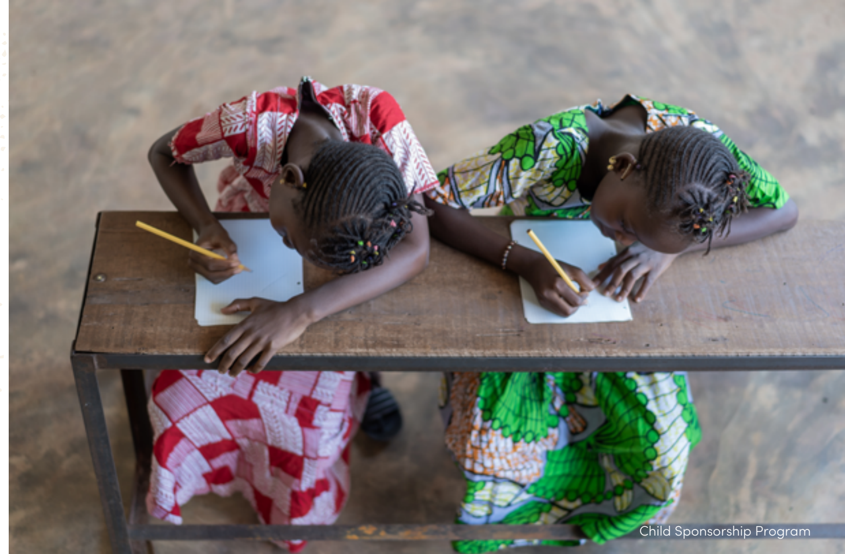
Child Sponsorship Program

Projects and programs served by TeachBeyond in Canada and the US