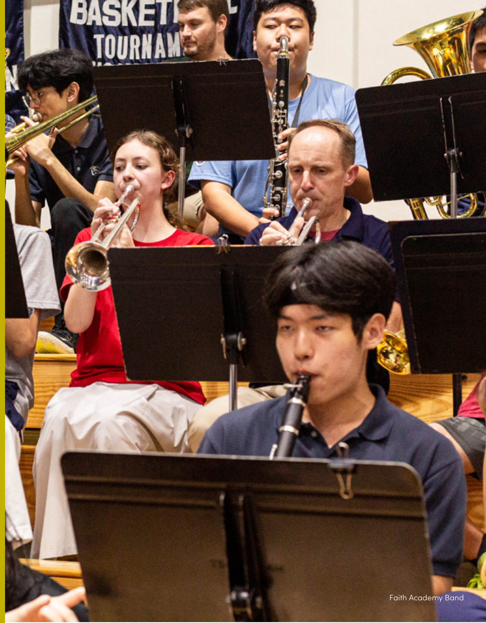
Faith Academy Band