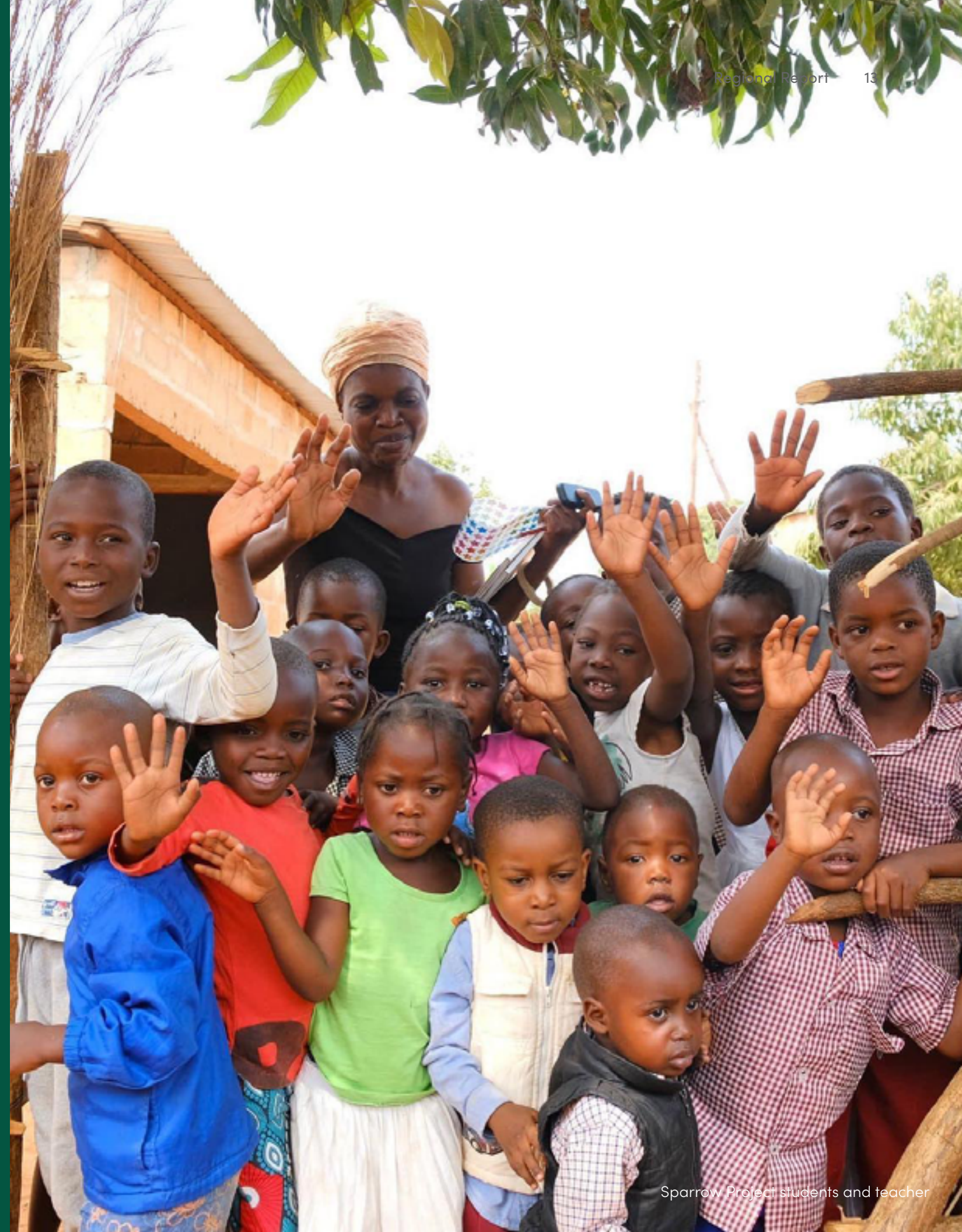
Sparrow Project students and teacher