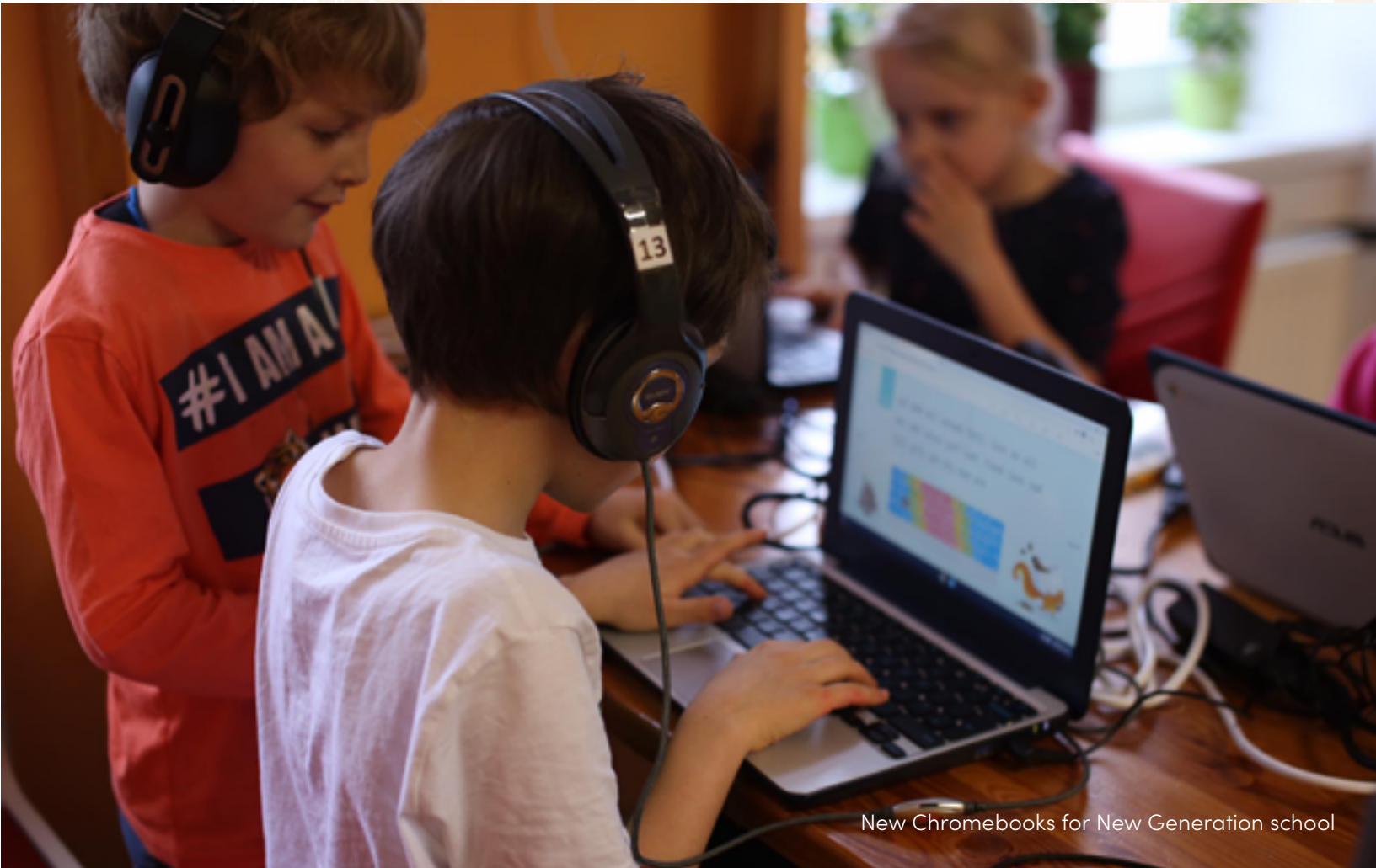
New Chromebooks for New Generation school