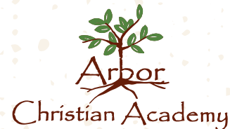
ARBOR CHRISTIAN ACADEMY arborchristianacademy.org

Acamp-Serra is a camping ministry in Brazil that provides overnight, day camps, and English camps for children, teens, and families.