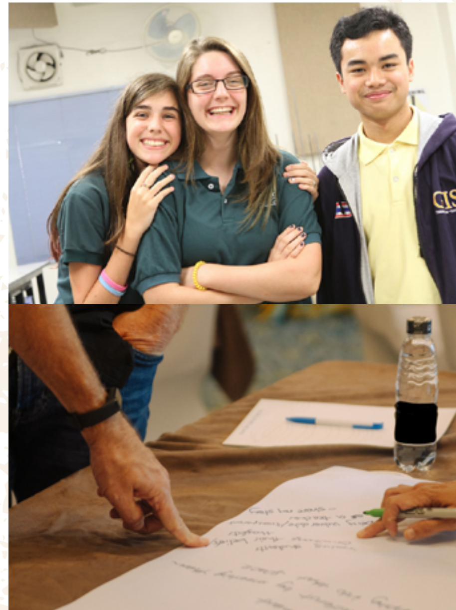
Top: Grace International School