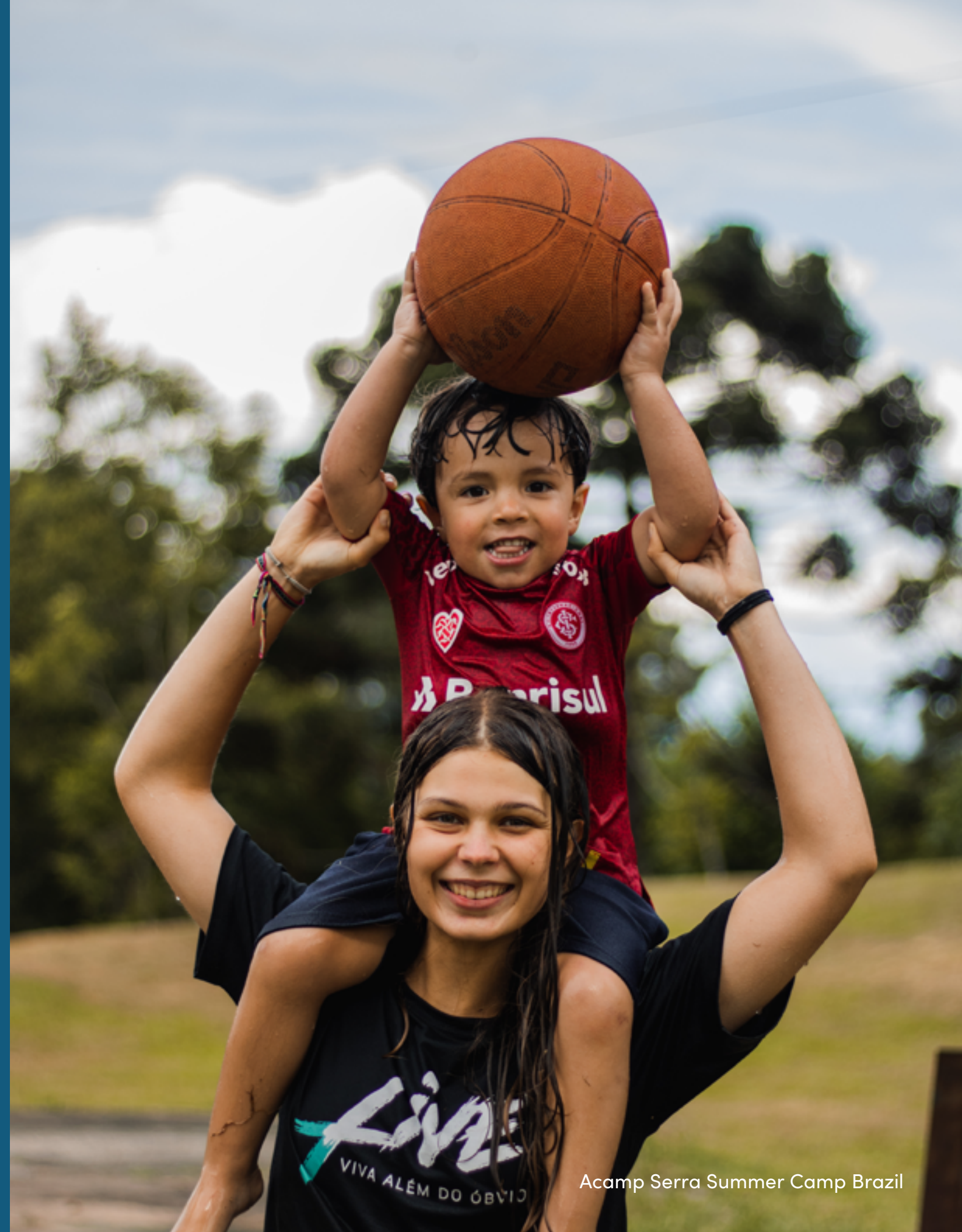
Acamp Serra Summer Camp Brazil